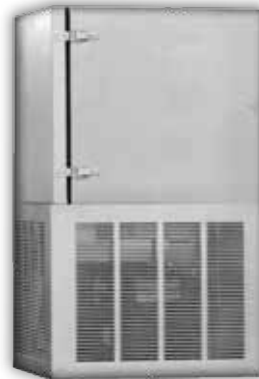
Indoor wall mount Capsule Pak