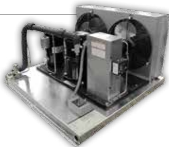
Indoor Split-Pak condensing unit