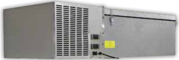
Indoor ceiling mount Capsule Pak