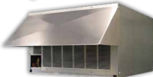
Outdoor Split-Pak condensing unit