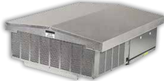
Outdoor ceiling mount Capsule Pak