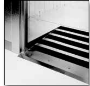
Interior ramps* make it easy to roll items directly into your walk-in.