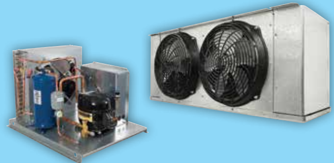
SPLIT-PAK™ REMOTE SYSTEMS INDOOR & OUTDOOR MODELS**