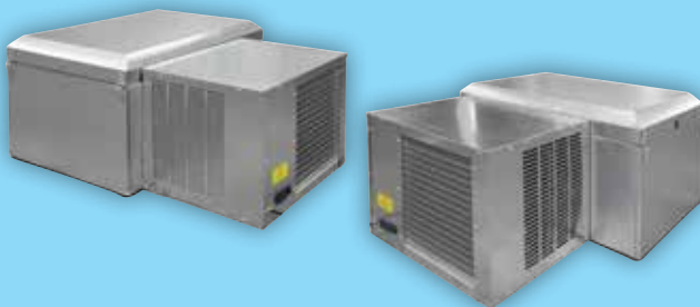
CAPSULE PAK™ SELF-CONTAINED SYSTEMS INDOOR & OUTDOOR MODELS*