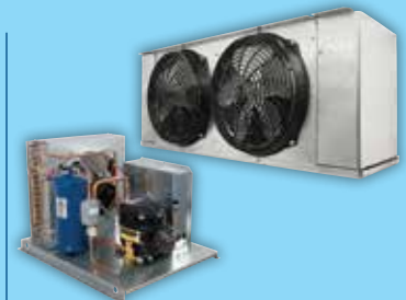
SPLIT-PAK™** REMOTE INDOOR & OUTDOOR Systems ranging from .5 to 40 HP