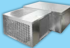
CAPSULE PAK ECO™* SELF-CONTAINED INDOOR ONLY