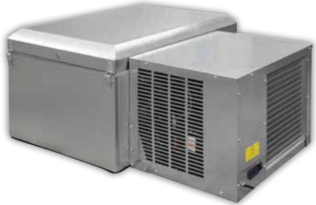
Indoor ceiling mount self-contained Capsule Pak