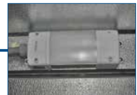
LED interior lighting