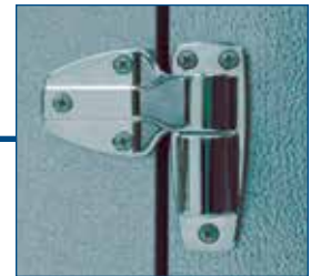
Adjustable door hinges