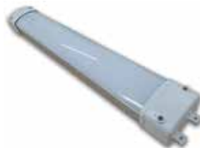
P/N 157751 24" optional ceiling mount