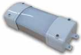
P/N 157750 9" standard over door - optional for ceiling mount

LED lighting minimizes energy expenses and maximizes profitability in walk-in operation. LED lighting is also ideal for walk-in coolers and freezers because performance is maximized in cold environments. LED lighting provides substantial energy savings and will maintain or increase light output.