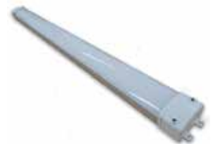
P/N 157752 48" optional ceiling mount