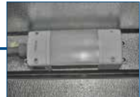
LED interior lighting