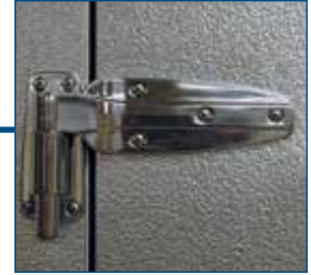
Heavy duty adjustable cam-lift door hinges - one spring loaded (patented)