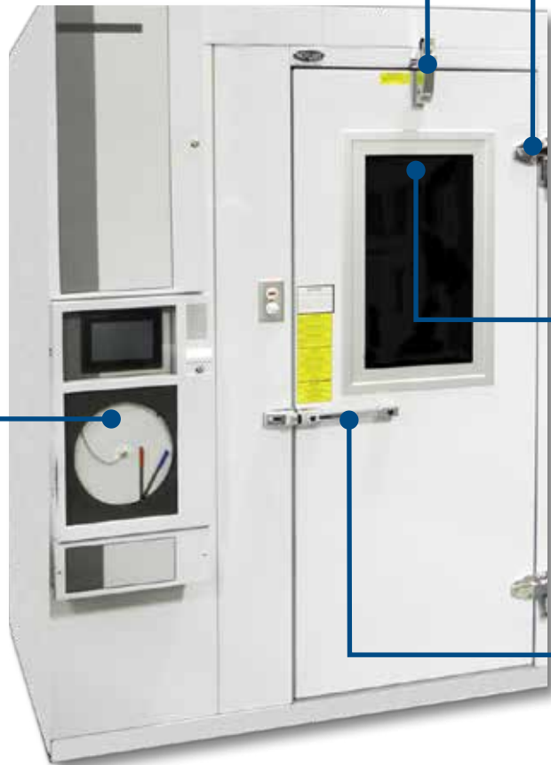
Model shown with custom white exterior.