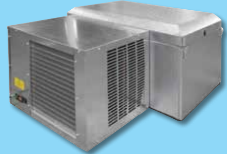
Capsule Pak systems are available for indoor or outdoor installation.

Additionally, dedicated medium temp outdoor condensing units meet the DOE requirement of a minimum AWEF rating of 7.61 (Btu/W-h).