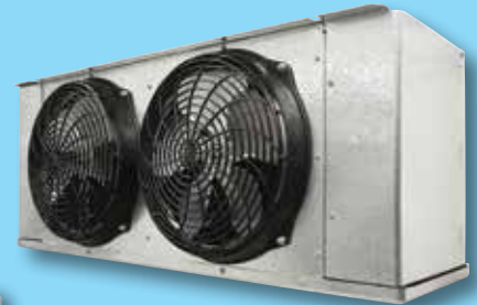
Split-Pak remote refrigeration systems consist of condensing units and evaporator coils for use in walk in coolers and freezers.