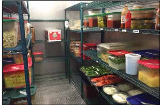
Optional shelving kits allow you to utilize more walk-in space.