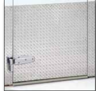
Kickplates add protection to your entry doors and frames.