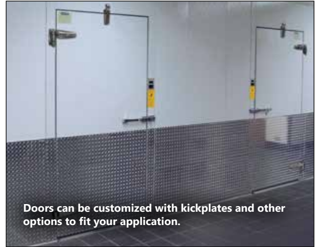
Doors can be customized with kickplates and other options to fit your application.