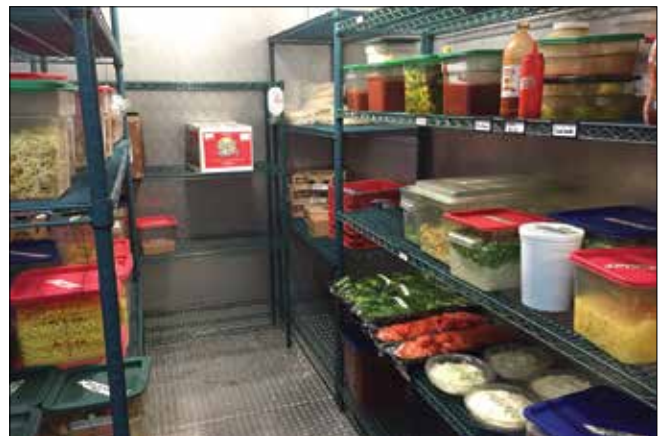
Shelving Kits fully utilize the space available in your walk-in.